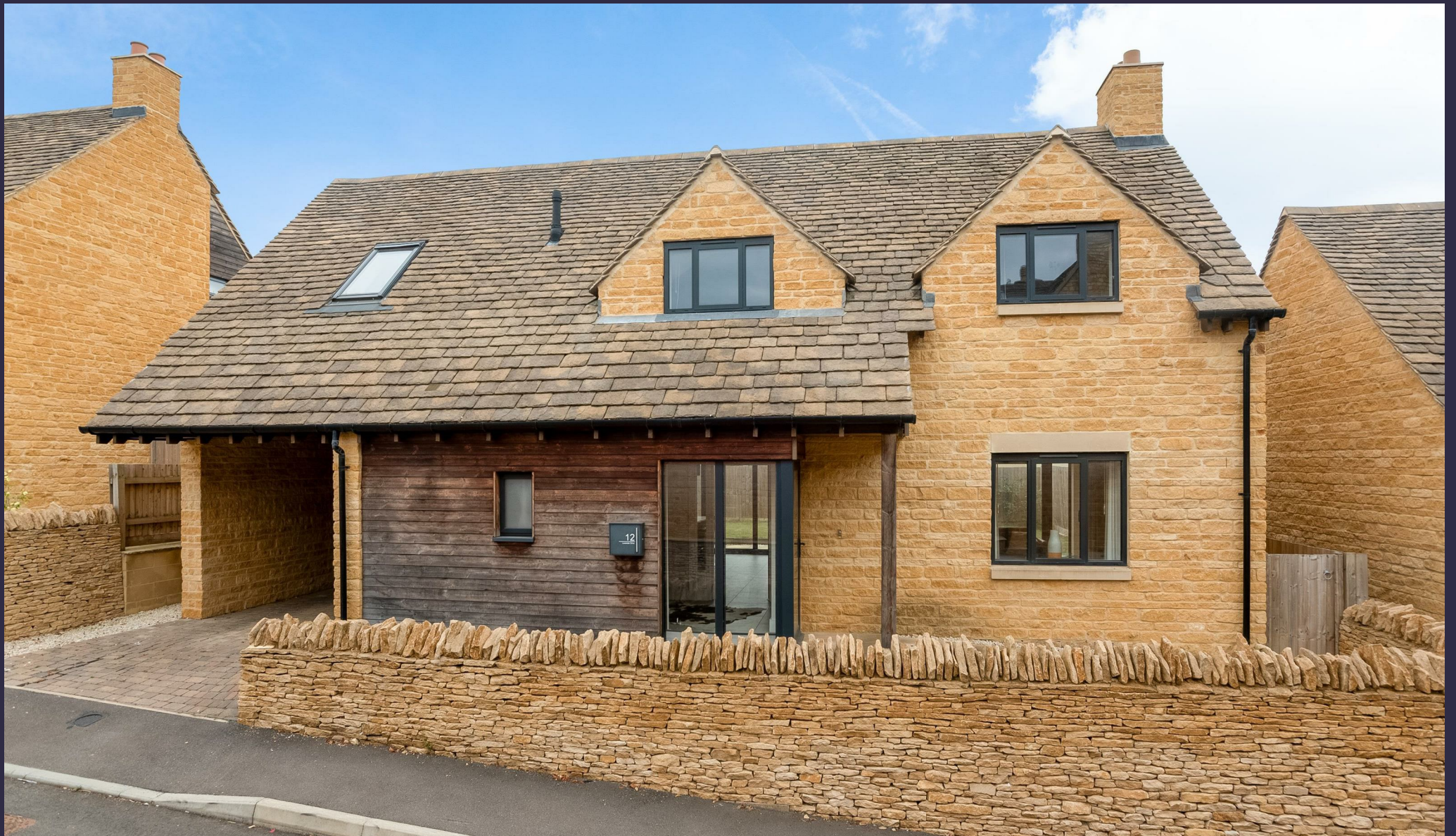
12 Lavender Drive, Chipping Campden, GL55 6EX